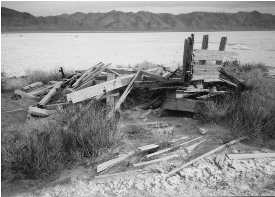
More Boat Debris