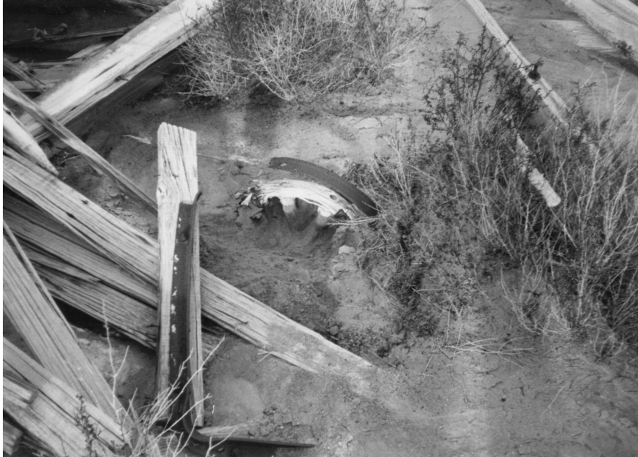
More Boat Debris