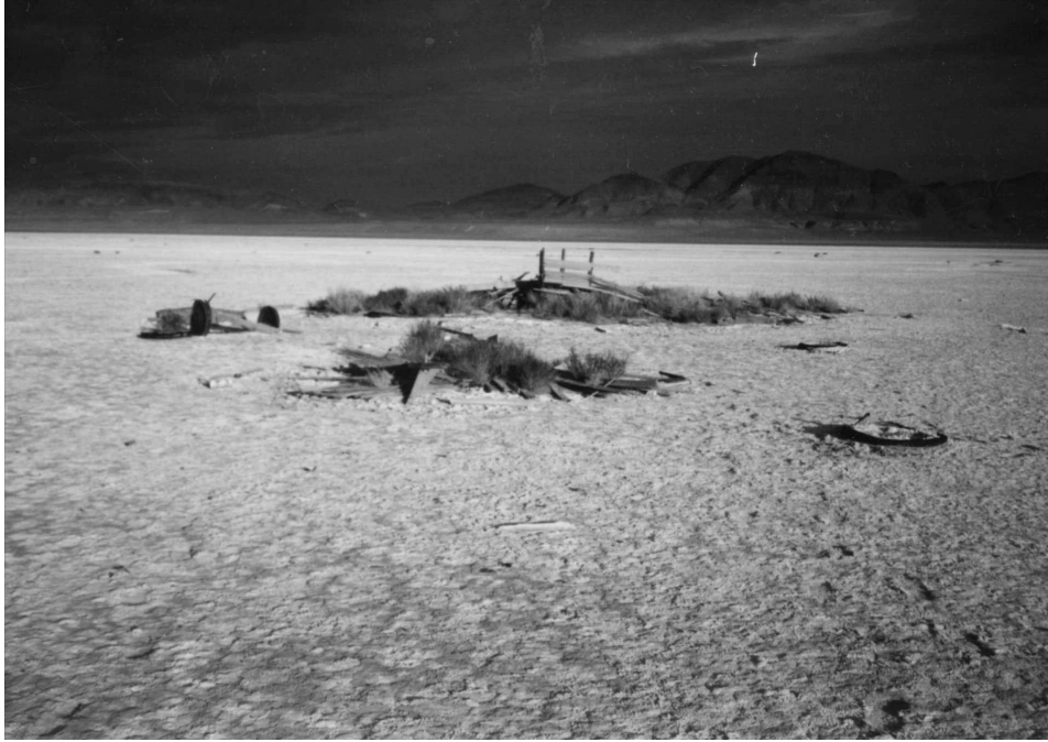
Overview of boat site on Winnemucca Lake.